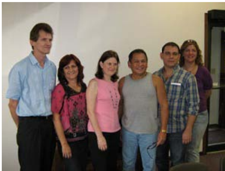
Some Managers of "Christ For All Nations" – Latin America LLL Event in Omaha.